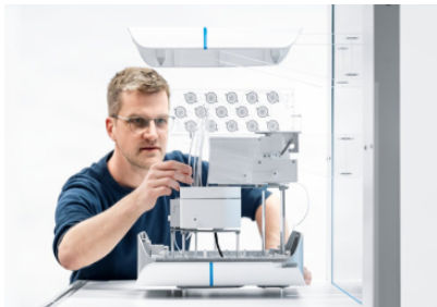
Exhibit CAR-T cell therapy

The exhibit shows the construction of a cassette for the modification of cells in CAR \mathbb{T} cell therapy components by Festo.